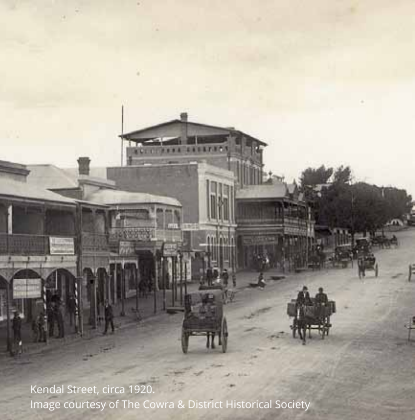
Kendal Street, circa 1920.