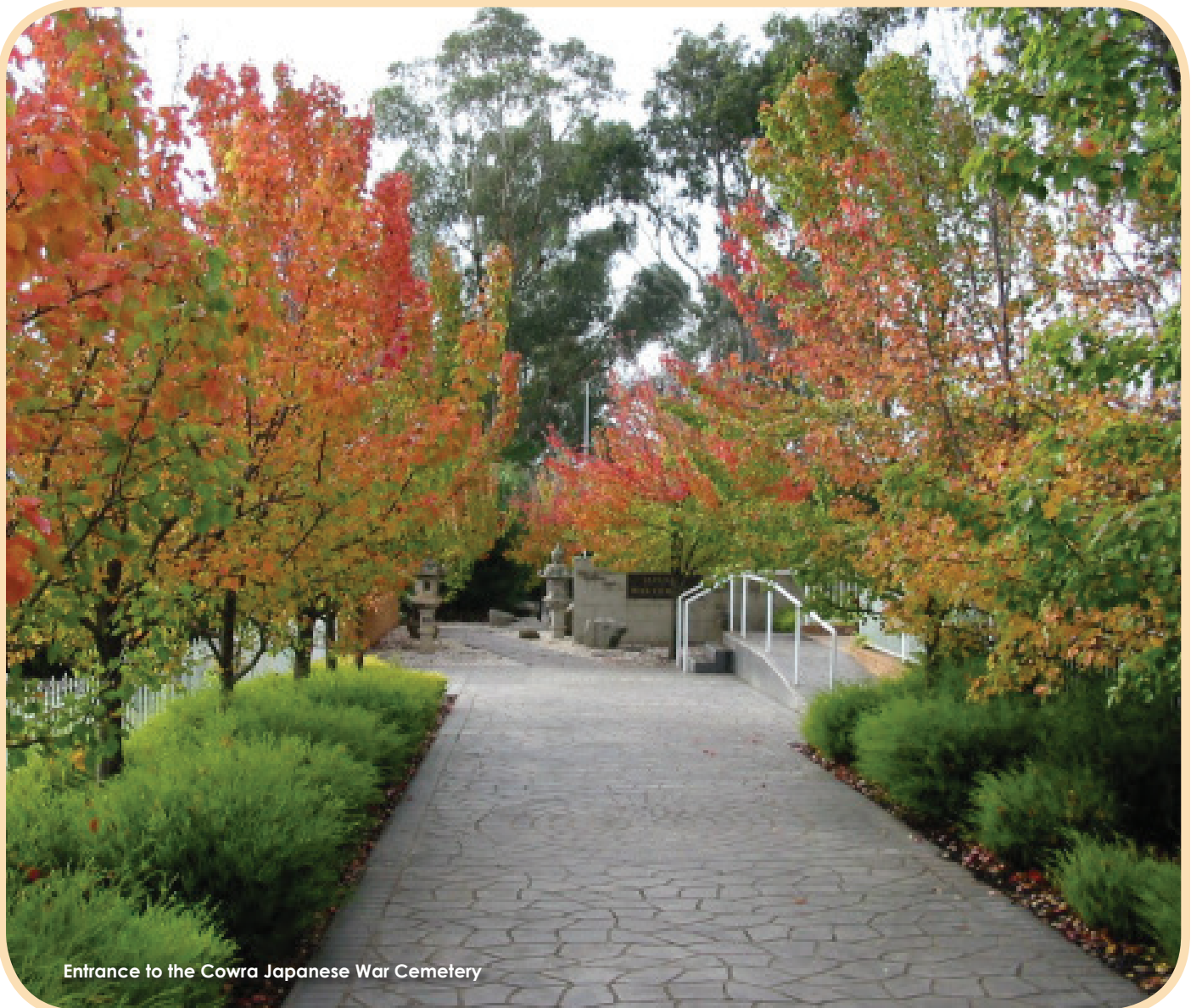
Entrance to the Cowra Japanese War Cemetery

These documents are available at Cowra Shire Council or at www.cowracouncil.com.au