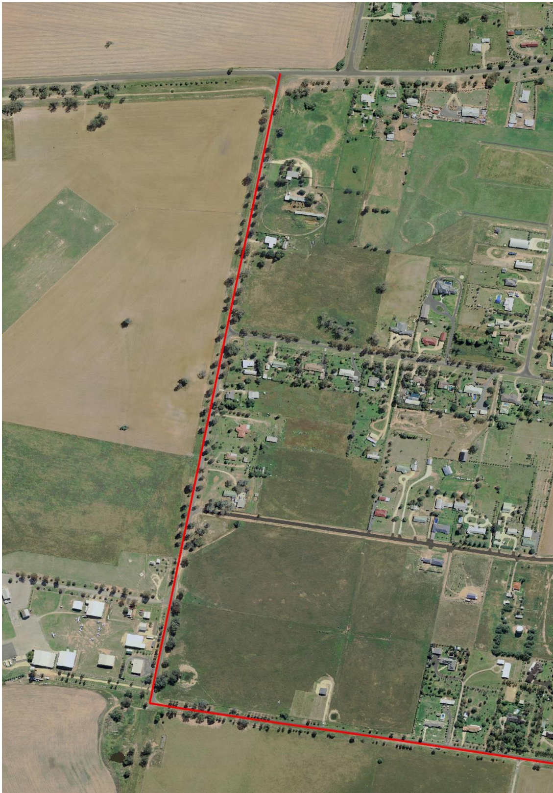
Figure 2: Mid-Western Highway (Grenfell Road) to Boundary Road (via Airport Road)