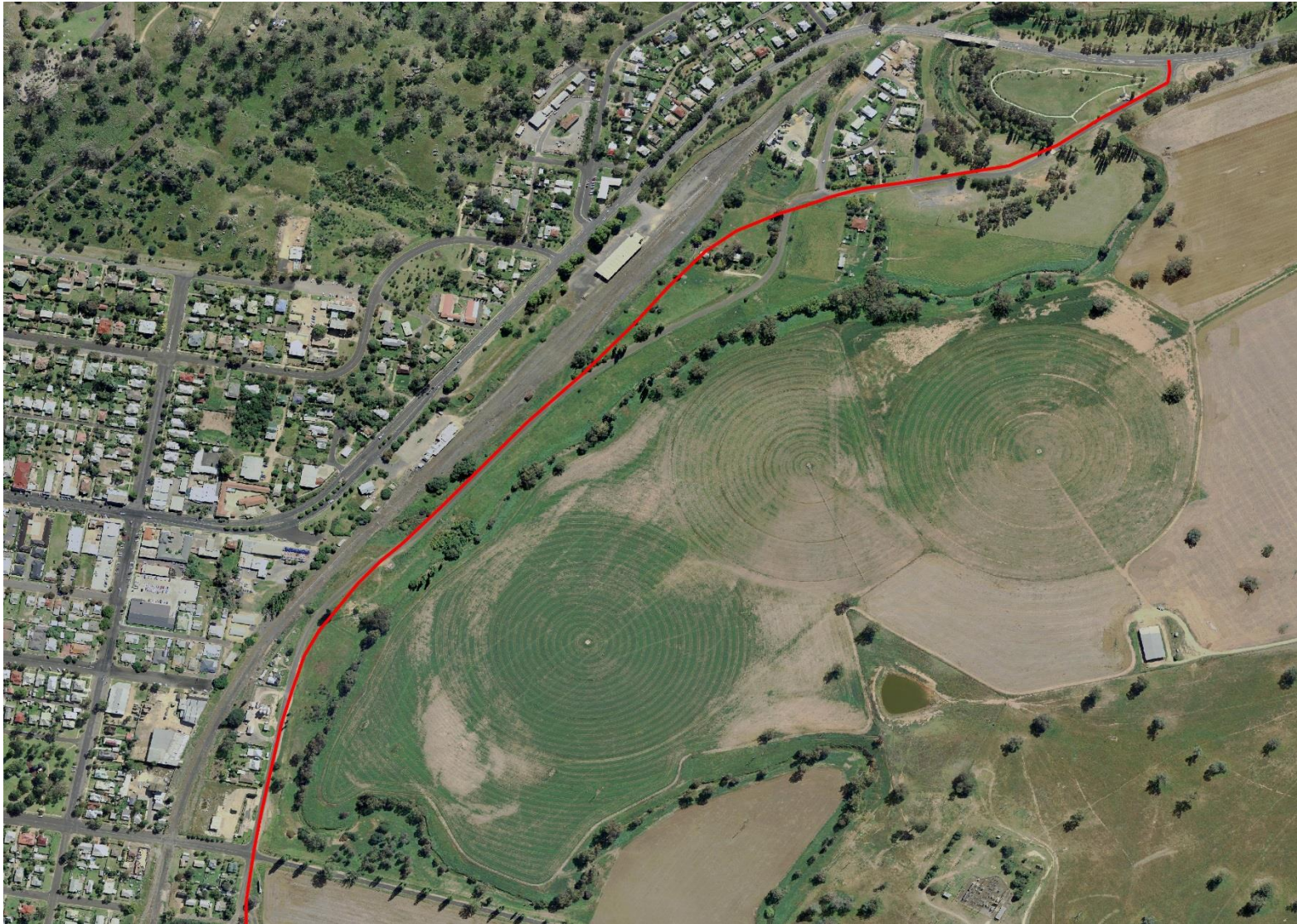
Figure 7: Darby Falls Road to Mid-Western Highway (east)