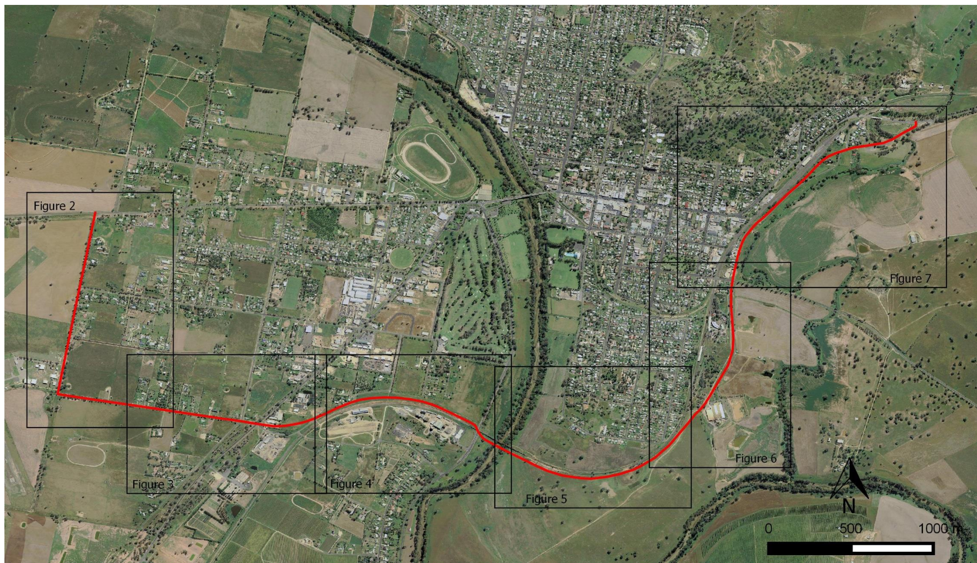
Figure 1: Route overview (route shown in red)