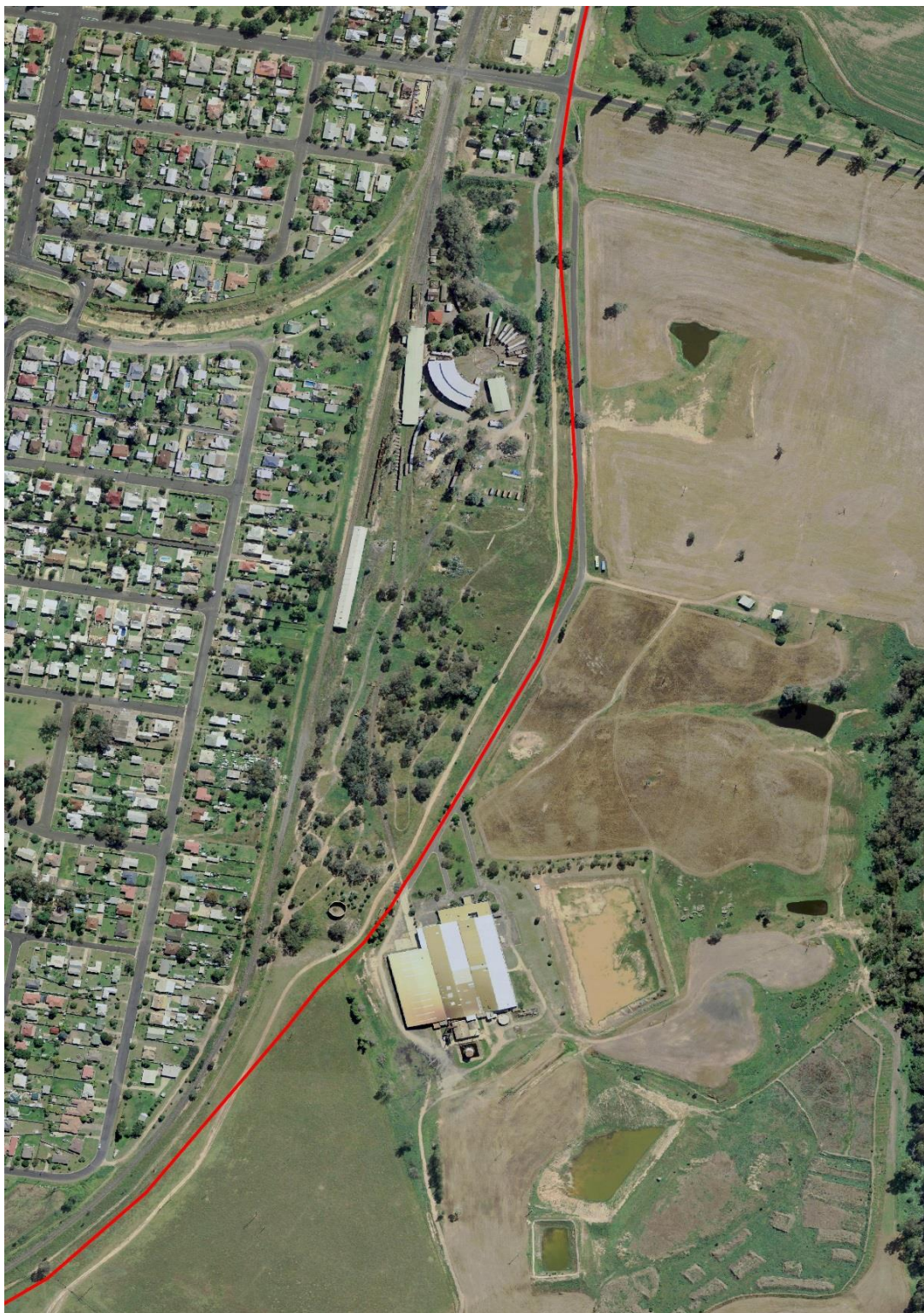
Figure 6: South Fitzroy Street to Darby Falls Road