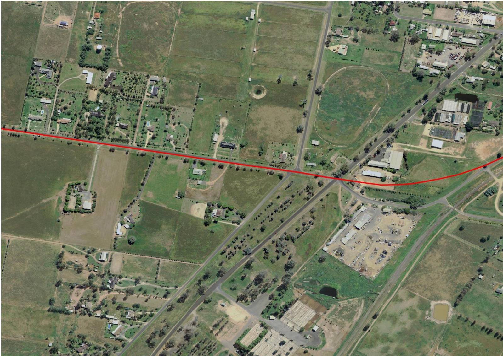
Figure 3: Boundary Road to Olympic Highway/Fishburn Street