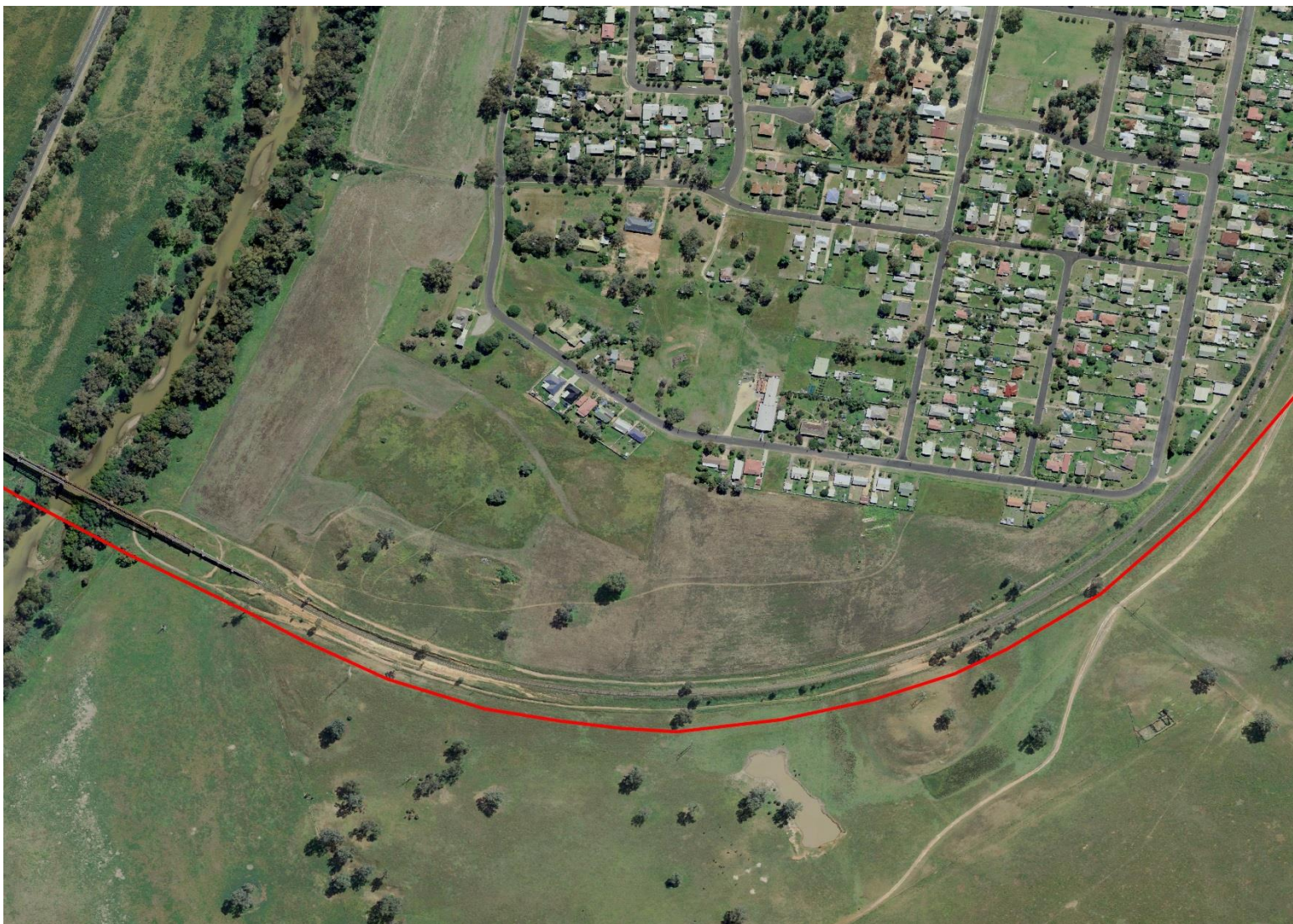
Figure 5: Lachlan River to east of Fitzroy Avenue/Taralga Street intersection